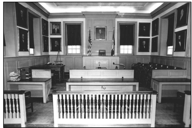
Historic Hanover Courthouse, c1976